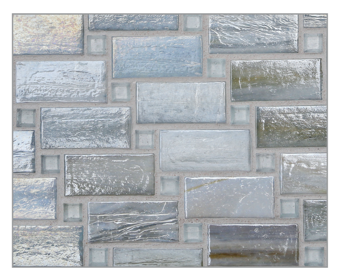
Vineyard (1/2 x 1/2, 1 x 2) (11.5 mm, x 11.5 mm, 25 mm x 50 mm)