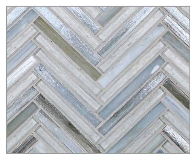
Zig & Zag (1/2 x 4)