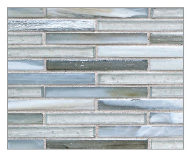
<sup>1</sup>/<sub>2</sub> x 4 Brick (11.5 mm x 100 mm)